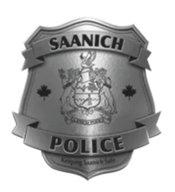
Saanich Police Board